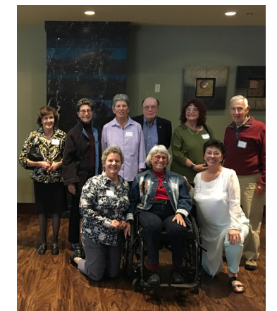
14 CASA Emeritus and Retired Faculty Luncheon