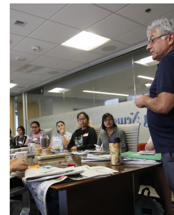
11 Mosaic Celebrates 24 Years