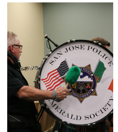
9 Justice Studies Holds 4th Annual Showcase