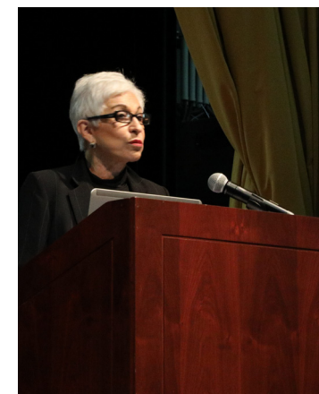
5 CASA Service Awards