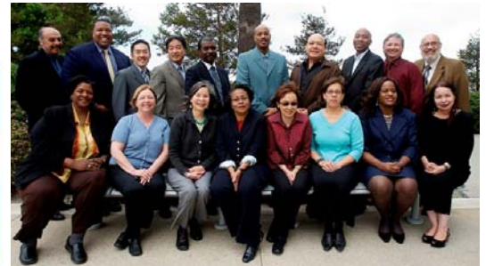
Left: EOP's 40th Anniversary logo Above: EOP Directors and other administrators.