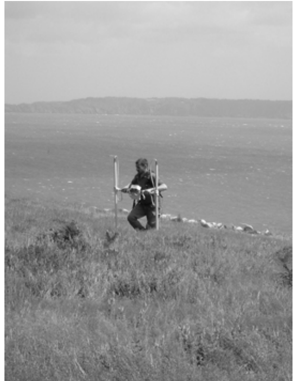
Geophysics (Renfrew and Bahn 2009)

Computer labs for student use are available in the Academic Success Center located on the 1 st floor of Clark Hall and on the 2 nd floor of the Student Union. Additional computer labs may be available in your department/college. Computers are also available in the Martin Luther King Library. A wide variety of audio-visual equipment is available for student checkout from Media Services located in IRC 112. These items include digital and VHS camcorders, VHS and Beta video players, 16 mm, slide, overhead, DVD, CD, and audiotape players, sound systems, wireless microphones, projection screens and monitors.