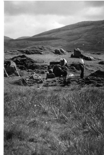
Archaeological Unit (Stein 1998)