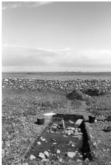
Archaeological Excavation Unit in the Outer Hebrides, Scotland (Stein 1998)

The Peer Mentor Center is located on the 1 st floor of Clark Hall in the Academic Success Center. The Peer Mentor Center is staffed with Peer Mentors who excel in helping students manage university life, tackling problems that range from academic challenges to interpersonal struggles. On the road to graduation, Peer Mentors are navigators, offering “roadside assistance” to peers who feel a bit lost or simply need help mapping out the locations of campus resources. Peer Mentor services are free and available on a drop –in basis, no reservation required. The Peer Mentor Center website is located at http://www.sjsu.edu/muse/peermentor/