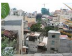
A neighborhood in Tan Phu