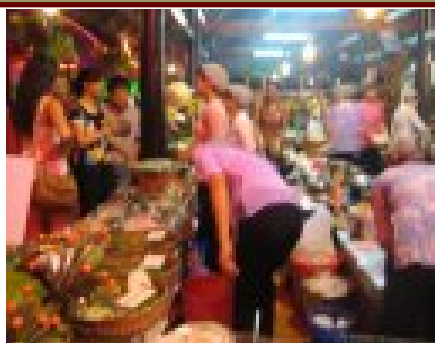
A Busy Market in Saigon