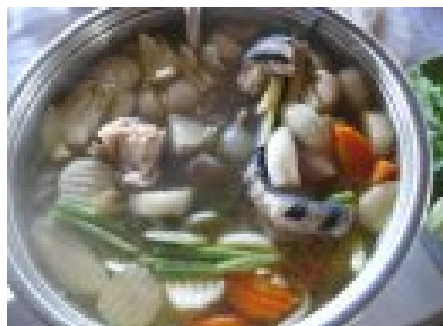
A Bowl of Minh's favorite, Vietnamese Snake Soup

But since the country took back its government in the '80s, it has been showing what has been there all along— lush scenes of rice patties and its mystical mountains serving as a background, its people who have preserved through oppression and war, and the strength that emanates from its streets and coffee.