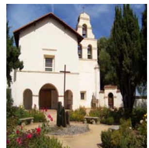
The Mission at San Juan Bautista

The day concluded with a dinner at Bubba Gump Shrimp Co. Restaurant & Market, to the delight of many students. By the time the group came back to campus around 7 p.m., everyone was reluctant to part ways but ready for a good night’s sleep. And after a full day of so many discoveries, it was well deserved.