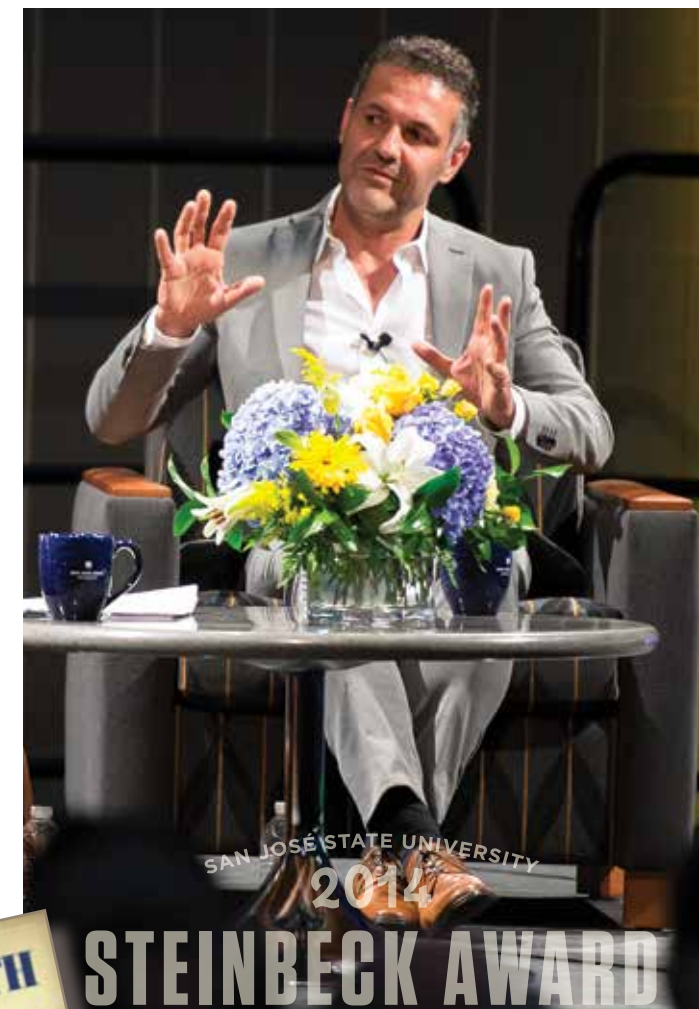
Khaled Hosseini, in an hour-long interview at the New Student Union in September, talked about the parallels between the migrant experience of the Joad family and other Okies in John Steinbeck's The Grapes of Wrath and families uprooted by war in his native Afghanistan. "I suspect there are a lot of Ma Joads in Afghanistan right now, trying to keep their families together," Hosseini said.

they're just ripe for finding their own identity and you can do that through literature.