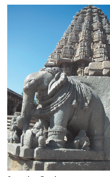
Somnathpur Temple, Bangalore

To download a copy of the GTI 2008 Yearbook and view photos from the study-tour, go to: www.engr.sjsu.edu/about/news/gti-dinner