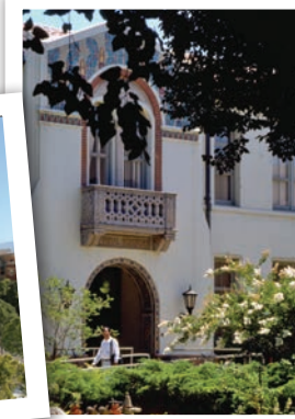
WASHINGTON SQUARE HALL