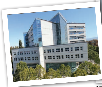
DR. MARTIN LUTHER KING, JR. LIBRARY

SJSU powers the Silicon Valley economy, contributing more than 7,000 graduates annually to its work force. We are immensely proud of the accomplishments of our 220,000 alumni, 60 percent of whom live and work in the San Francisco Bay Area.