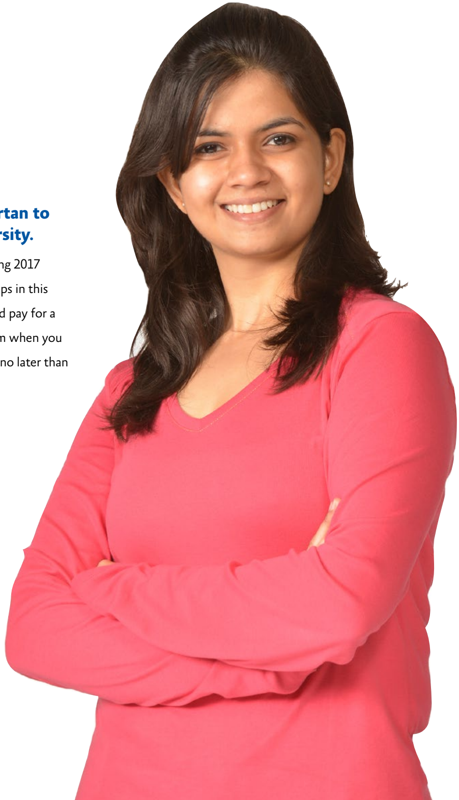
Deepna Software Engineering

To officially enroll for the Spring 2017 semester, please follow the steps in this guide. Make sure to sign up and pay for a mandatory orientation program when you submit your Intent to Enroll—no later than Tuesday, November 15, 2016.