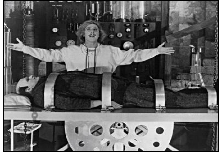
"Young Frankenstein" (Gene Wilder & Mel Brooks, 1974)

90 movies 17 tv-movies 8 made for video 22 tv series 3 video games Internet Movie Database (http://us.imdb.com/)