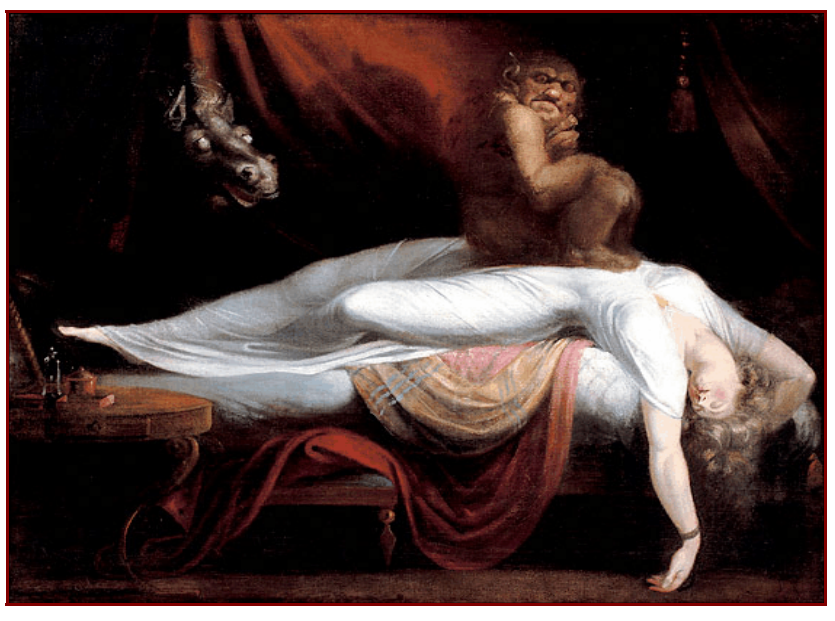
Fuseli's "The Nightmare" (1779; inspired by bad porkchop?) - inspiration for Frankenstein ? (Mary's mother had affair w/Fuseli)