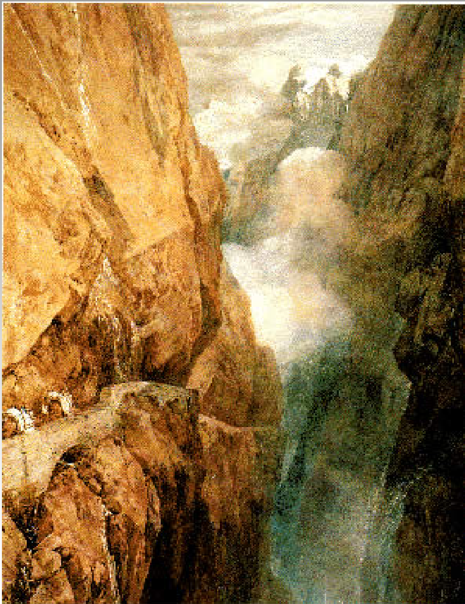
J. M. W. Turner, The Passage of the St. Gothard (1804). Watercolor