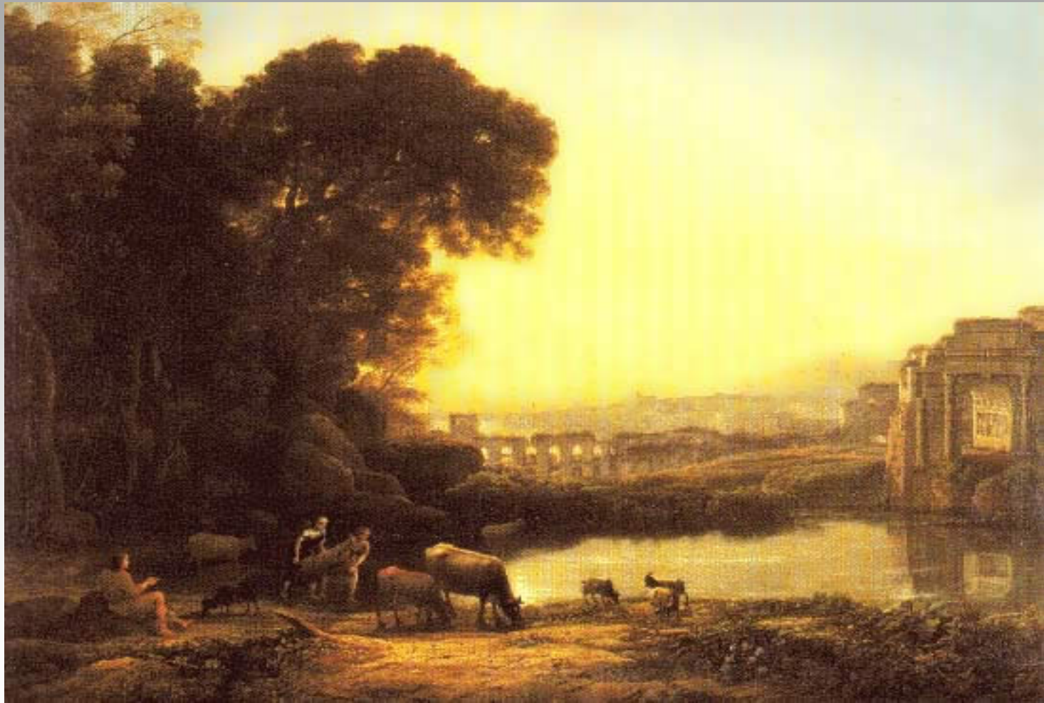
Claude Lorrain, Pastoral Landscape with the Arch of Titus