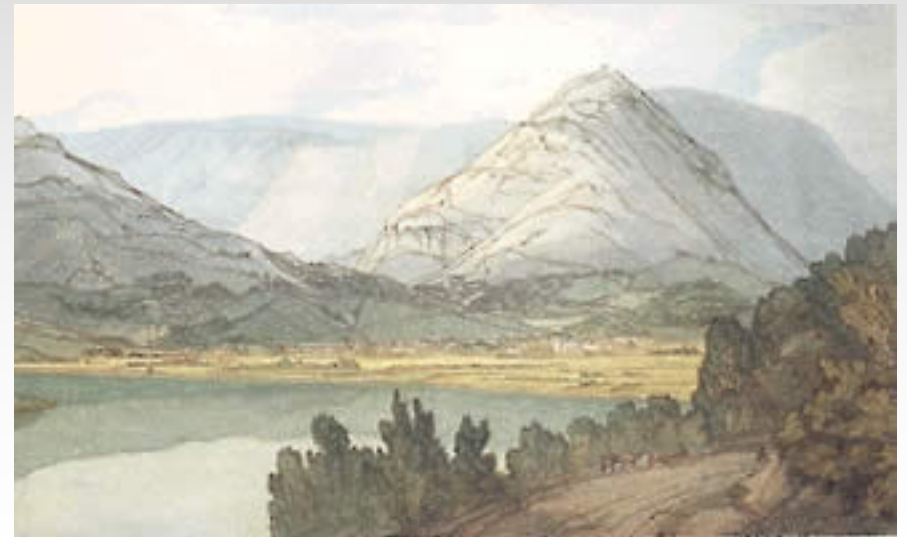
Ernest de Sélincourt, Grasmere . From Wordsworth's Guide to the Lakes , Fifth Edition (1835)