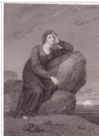
"Contemplation" Engraving from 1826 Forget Me Not