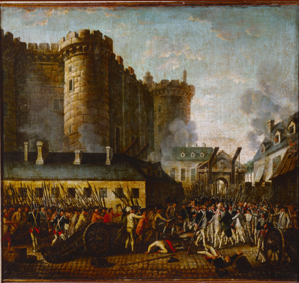
FrenchRev_3.jpg: The French Revolution . The taking of the Bastille, July 14, 1789.