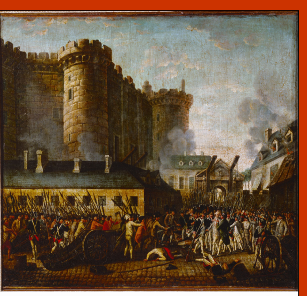
FrenchRev_3.jpg: The French Revolution. The taking of the Bastille, July 14, 1789.