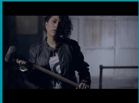
In The River by Raye Zaragozal