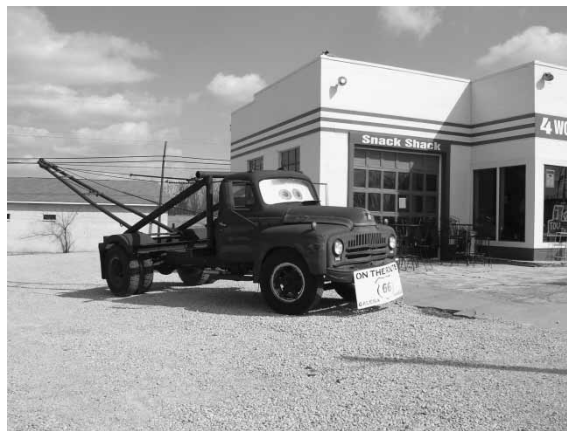
Figure 3. Tow Mater in Galena, Kansas.