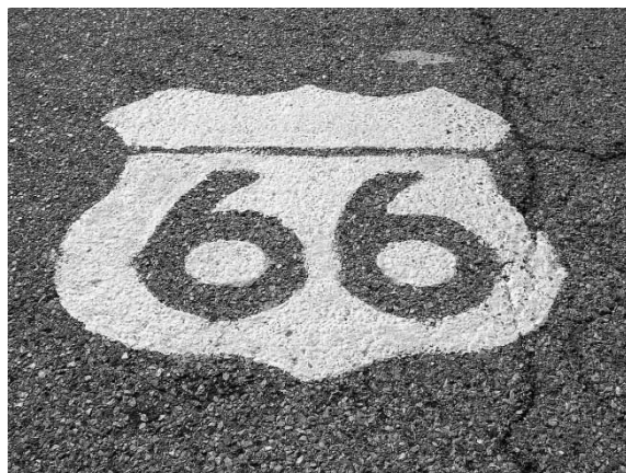
Figure 4. Kansas Route 66 shield.

What an irony then that Route 66 has come to represent an earlier, simpler time where people helped each other, chatted with each other, and saw America with each other. This fantasy, this "Route 66," exists as a series of set pieces, of names, histories, and destinations, and of those people who choose to perform these narratives out of passion or duty or the desire for profit. We reinvent the road just as we reinvent ourselves. Looking back upon the pliable past, we need not stare too closely at our weathered foundations when plenty of cleaner, safer, and more accessible histories wait, usefully fitting themselves to our needs. This place—Steinbeck's Mother Road, but also his "road of flight"—is a perfect lens upon our contemporary lament, that we are most authentic in our search for community when we recognize the solitary nature of that journey, that we are most honest about our ideals when we recognize briefly, fleetingly, the performances they entail. It is a strange transformation indeed that we find ourselves looking backward with misty eyes to the technologies and structures, to the road, that got us here in the first place.