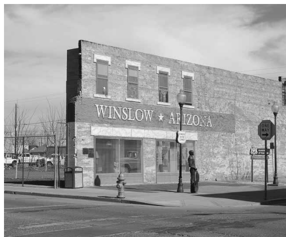
Figure 1. Standin' on "the" Corner in Winslow, Arizona.

When high-speed interstates bypassed the old two-lane road that brought traffic downtown, Winslow seemed poised to disappear. But local entrepreneurs capitalized upon Winslow's connections to the famed Eagles song, along with its Route 66 roots, helping bring the northern Arizona railroad town back to life. Many visitors stop by for a momentary snapshot, maybe grabbing coffee at a nearby cafe, but some stay longer and spend more money, either here or further down the road. For a growing number of tourists, towns fashioning some of their identities along and around Route 66 form a sprawling repository of Americana as a constellation of media texts. I am one of these tourists, outlining in this essay a thumbnail history of that road and sketching out a method of its analysis before concentrating my attention on ways in which Route 66 offers ever more simulations and simulacra of itself. I conclude with some consideration for implications of an America whose dream of freedom seems increasingly distanced from the realities of civic life.