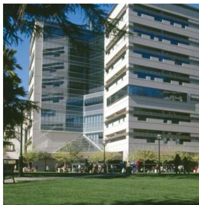
Marthin Luther King Library, SJSU