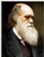
Charles Darwin: Theory of Evolution by Natural Selection