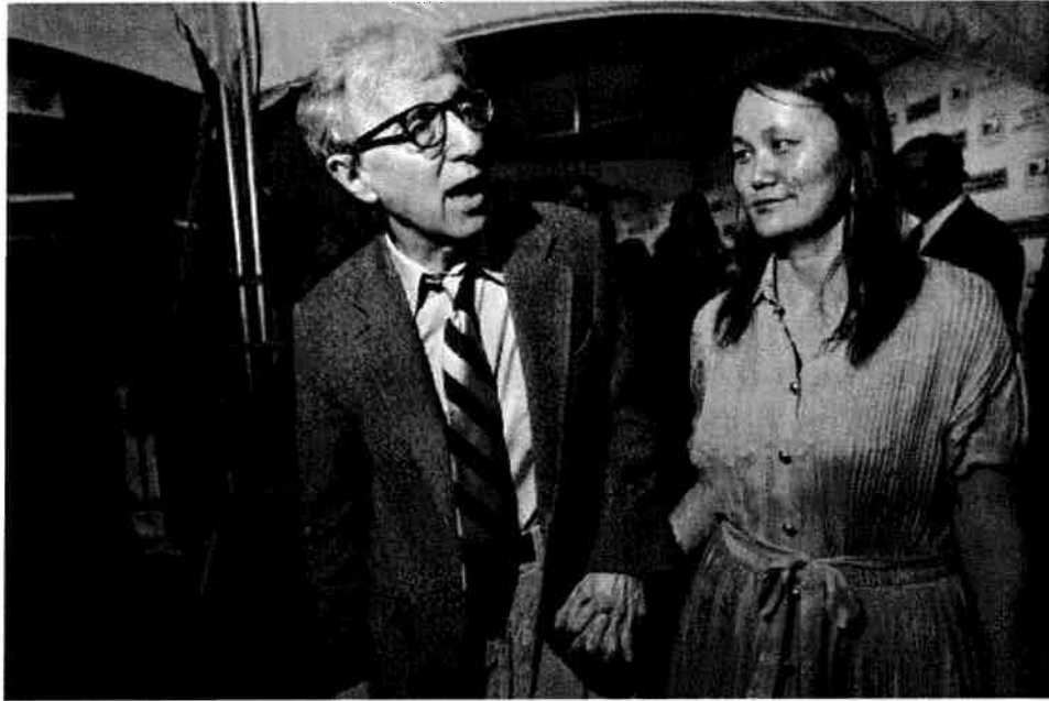
Woody Allen and Soon-Yi Previn at the premiere of Whatever Works at the Tribeca Film Festival.

want to play Boris himself, feeling he was too old—David is 61—and may have lacked the character’s natural aggression.)