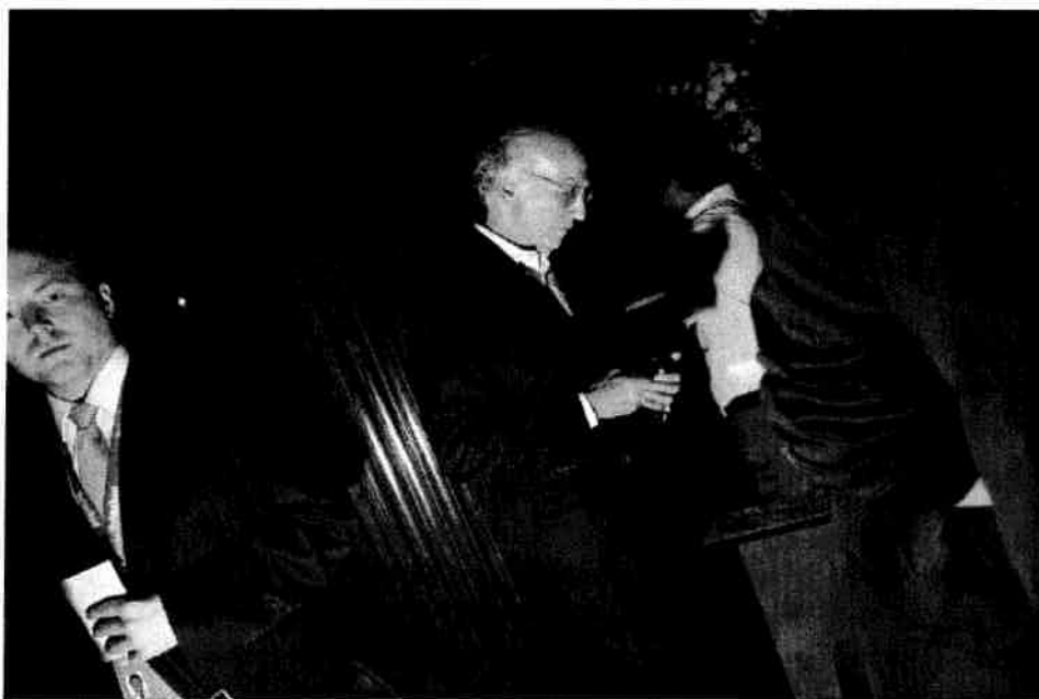
Larry David at the premiere.

This either-way-you-lose equation—ingrown depression or jabbing aggression, tic-ish agitation or unsocialized anarchy, Felix or Oscar, choose your poison—used to be essential to a brand of Jewish comedy that mined laughs from the act of chafing against everything you felt excluded from, less worthy than, or insecure about. (Rodney Dangerfield was in his forties before he found his fame-making gimmick, and that “I don’t get no respect” was the expression of an underlying truth that many Jews believed about their place in non-Jewish America.) It didn’t matter if everyone was laughing with your pain, or at it: Take my strife—please!