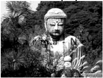
Saturday, April 27, 2002, 10:30am-5pm San Jose State University, University Club, 408 S. 8<sup>th</sup> Street San Jose, CA, 95192