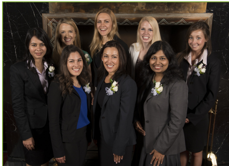
2013 Scholarship Recipients