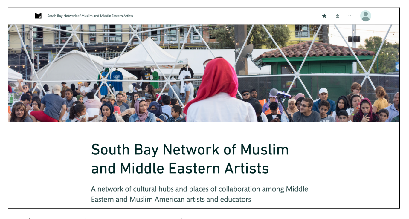
Figure 2.4: South Bay StoryMap Screenshot

"One of the things that we try to do in our event is have different types of cuisines and different types of cultures represented because that's one thing that we wanted to show to the general public, as well as the Muslim community... Sometimes even our own people, they just get used to eating only a certain few cuisines, so we try to show that hey, Muslims come from all over the world. And here in the Bay Area, you know, it's a diverse community."