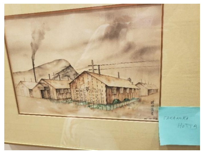
堀田高廣 (Hotta, Takahiro), (b. 1928) Untitled , September 18, 1944 Watercolor on Cold-Press Paper (Description: Blocks and electric lines at Camp Tulelake, CA)