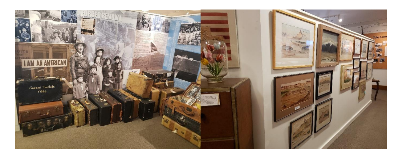
WWII Incarceration Exhibit