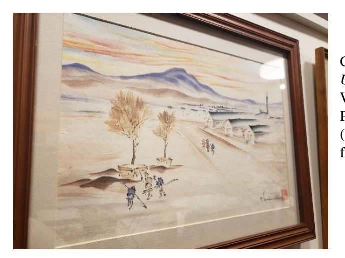
Chiura Obata (b. 1885 – 1974) Untitled , n.d. Watercolor w/ Chinese Ink (Sumi-e) on Cold-Press Paper (Description: Blocks and Mountain-scape with figures in foreground at unknown location)