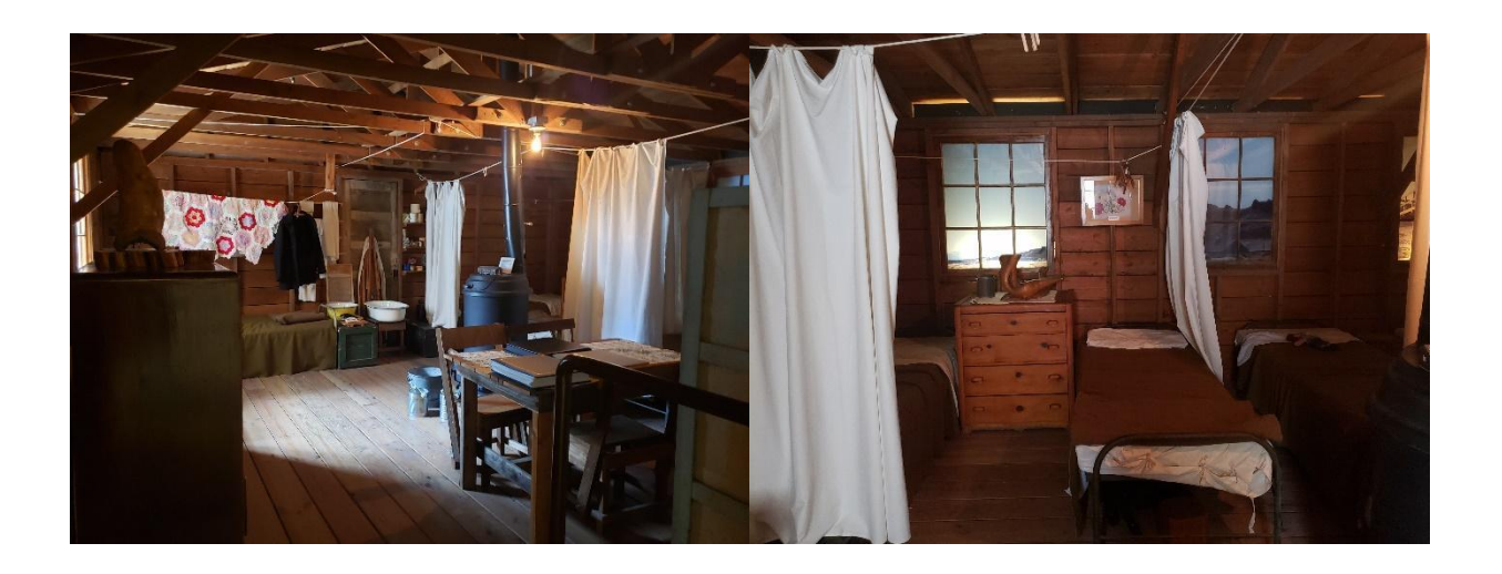
The Barracks Room