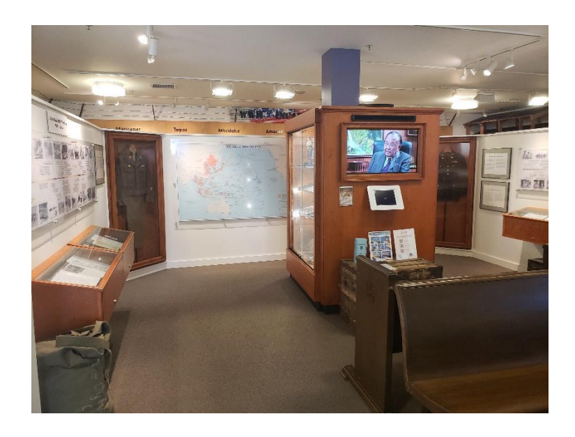
442<sup>nd</sup> MIS Exhibit