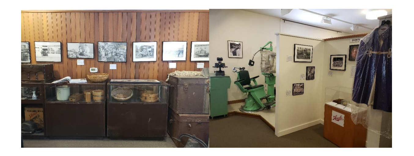
Old Japantown Exhibit