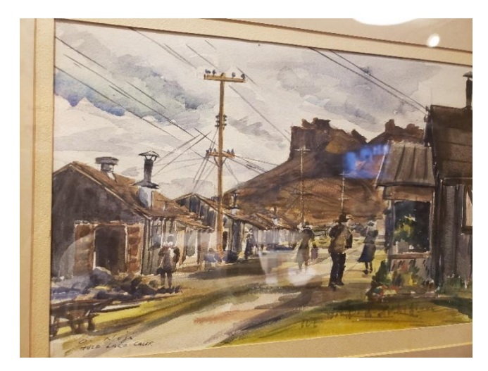
Oliver K. Noji (b. 1904) Tule Lake Calif., n.d. Watercolor on Cold-Press Paper (Description: Busy block neighborhood at Camp Tulelake, CA)