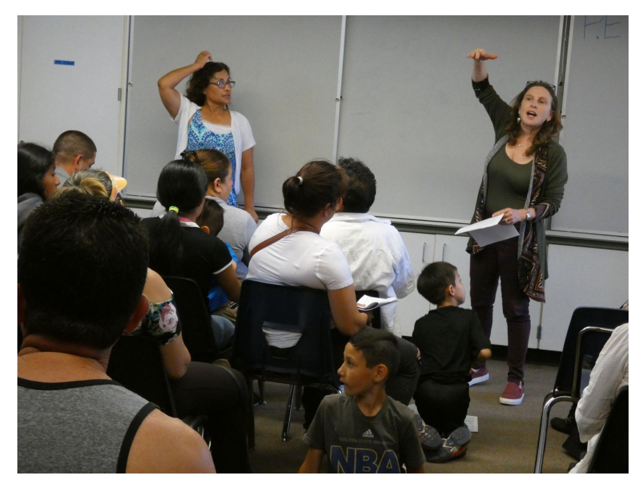
Figure E. One of the Succeeding Together classes where a teacher discusses with the families the importance of time management, setting a visual schedule, and how to better communicate with their children.

One striking example of the long-term effects of the program seemed to be that the participant's literacy skills and communication skills appeared to have improved. The length and clarity of the essays seemed to improve throughout the years. Some participants' writing skills improved significantly over time, and they tended to write longer, more detailed, and more expressive essays after participating in the program for several years. For instance, in 2009 the average word count of respondents' essays was 233 words. In 2018, the average word count of their essays had increased to 444 words. Not only did the writing increase in length, but the clarity and quality of the writing drastically improved. It is important to note, however, that although many individuals were able to practice and refine their literacy skills at the program, one cannot attribute the improvements of their writing solely to Succeeding Together. It is very possible that the longer the individual spent in the United States, the better adapted the