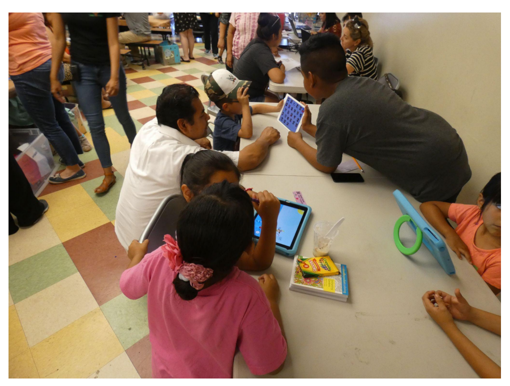
Figure B. Picture of a parent and child working on an academic mathematical game during the Succeeding Together program.

The participants in the program noted that they were provided with resources to improve their physical health. One participant was thankful for the consultations the program provided, "Thanks to the medical consultations and appointments we attend at the program, my family and I are more aware of our health. In the program, there are professionals who can measure our blood pressure, weight, check our eyesight, and our teeth. Before the program, we never took the time to pay attention to our health."