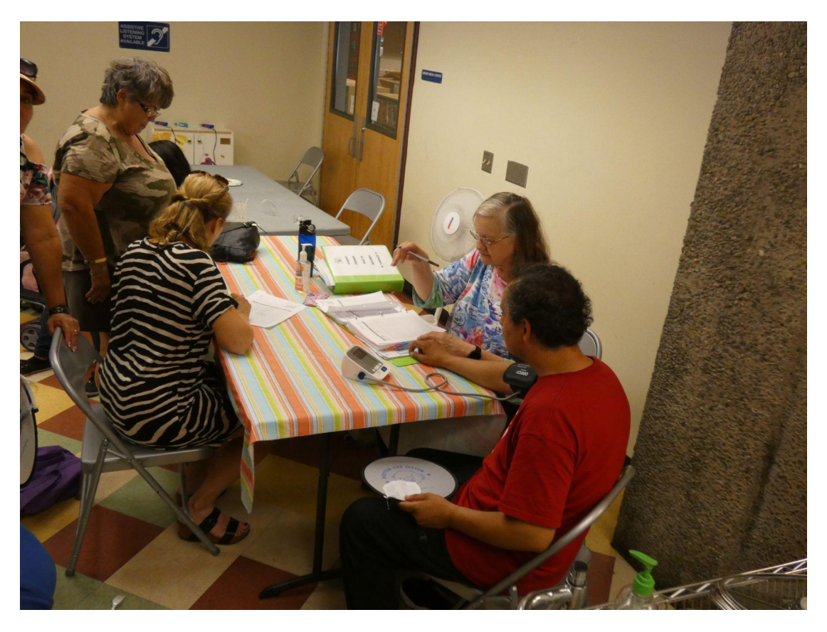
Figure F. Some of the Succeeding Together members waiting to get their blood pressure and weight checked by a local nurse during one of the programs in 2018.

Finally, in the essays, many of the participants reflected on the challenges of living in the area. Many families expressed difficulties with paying their bills, particularly when it came to housing cost. One member noted, "The rents in these areas are very high and they go up every year. I have just started to work and I cannot attend the program often but I try to make it whenever I can. Not only do I learn new things, but I also receive a lot of support from this program. I have received rent relief several times and this makes it easier to buy other things for my children." Living in Silicon Valley can be challenging for families, and many of the participants in the program shared their experiences of struggling to pay for their basic needs. Complex home-life challenges often impact these individuals financially, making it even more