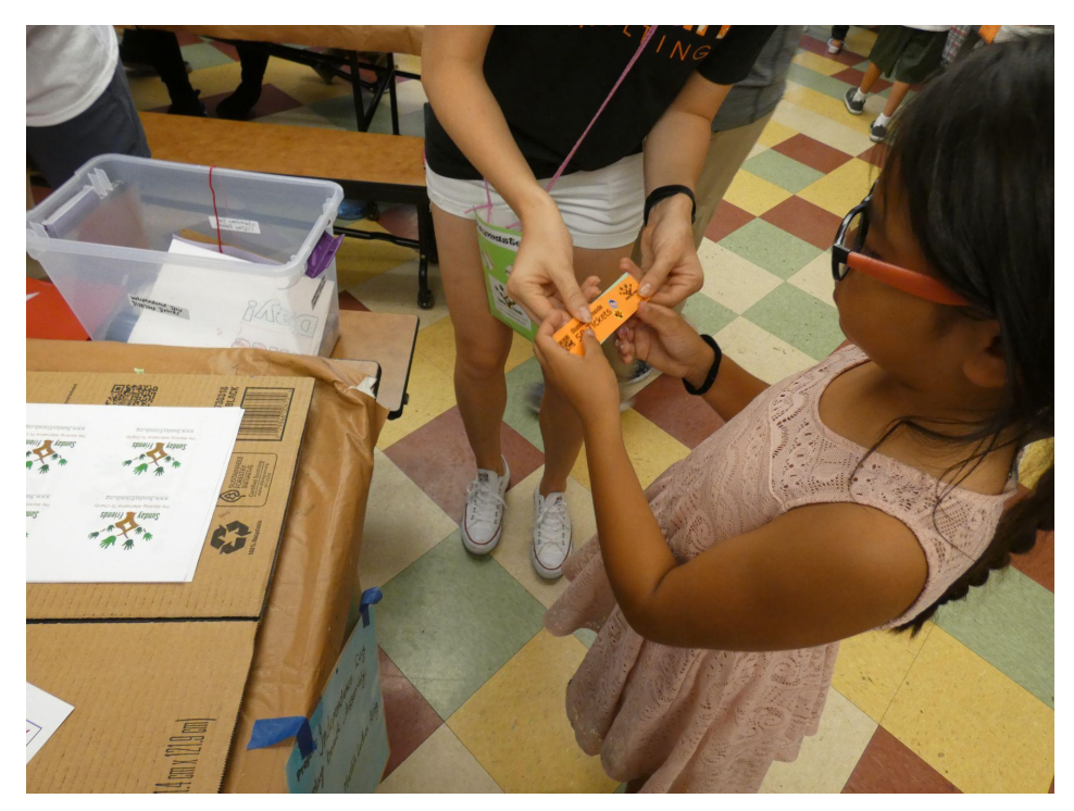
Figure D. A child earning "tickets" by participating in one of the Succeeding Together activities in 2018.

Many of the essays indicated that Succeeding Together is helping its members practice and educate them on the importance of financial literacy. The organization strives to teach the adults and the children who participate in the program to think about the future, save their tickets, and earn interest on their money. These processes strive to help families be more disciplined and forward-thinking individuals. Over the long term, if the program is successful in instilling these values, both the children and adults may be better prepared and able to become self-sufficient and financially responsible individuals.