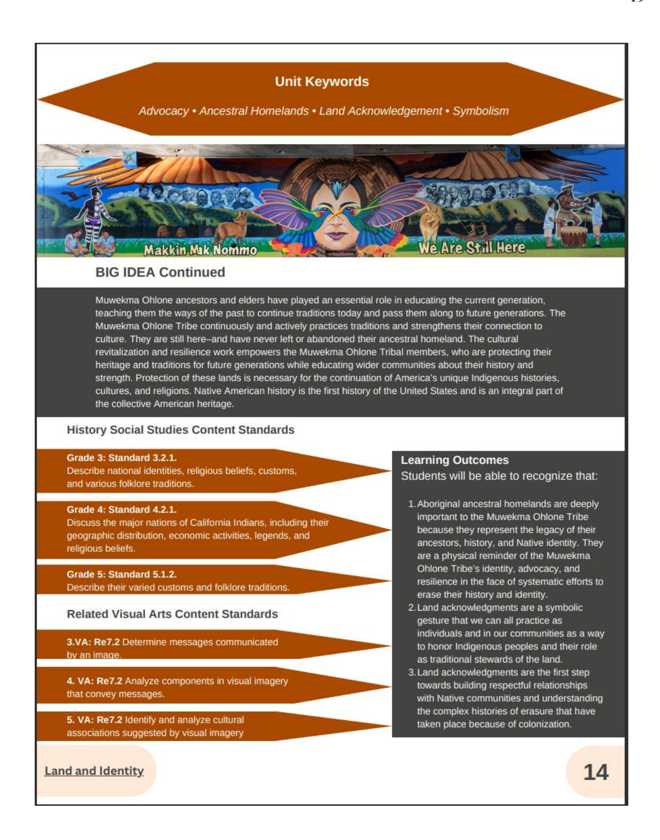
Figure 2: Depicted on pg19. Example from the Land and Identity section (Mural Thámien Rúmmeytak [thah-me-in roo-may-tak] Guadalupe River Walk).