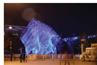
Jenny Wu February 24 Lineworks The Cube , a pavilion for the Beijing Biennale, 2013