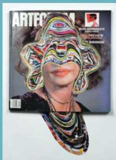
Francesca Pastine February 10 Artforum #47, Unsolicited collaboration with Cindy Sherman , 2013 Artforum magazine, screws, Plexiglas, wood 19 x 13 x 4.75"