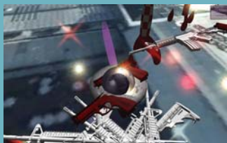
G. Craig Hobbs We Come in Peace screen shot 0.2, 2014 3D Computer Game