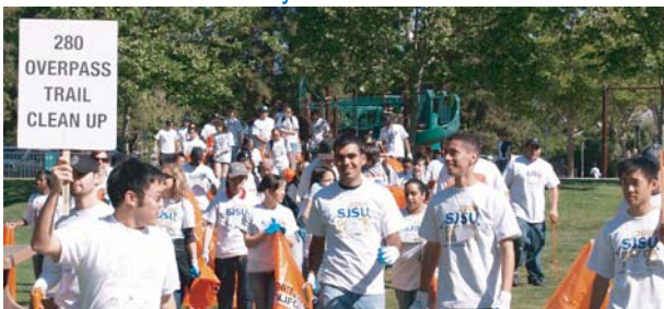
Day of Service