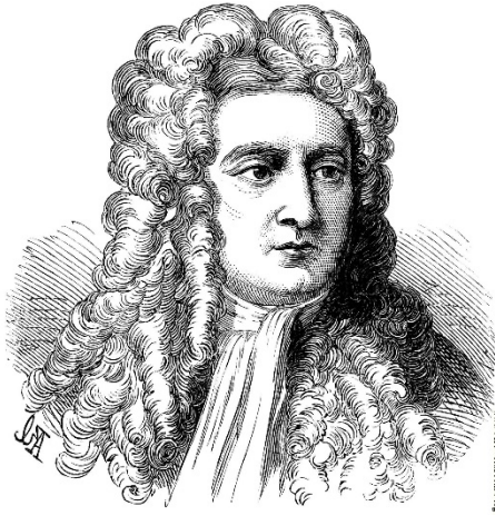
Sir Issac Newton