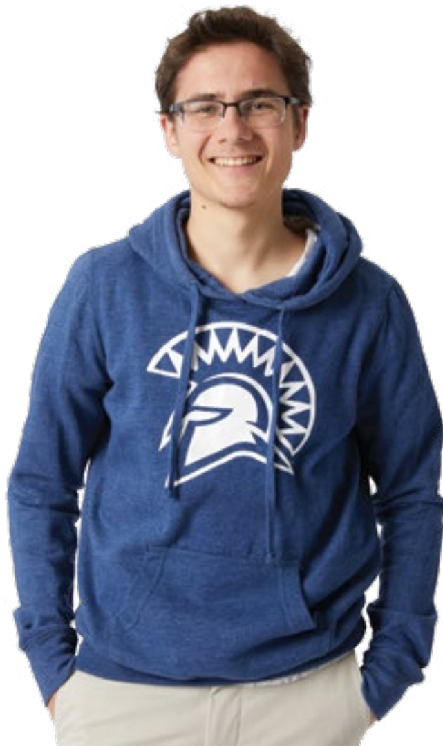
Nikola Biological Science/ Systems Physiology

Pay your enrollment deposit at nextsteps.sjsu.edu