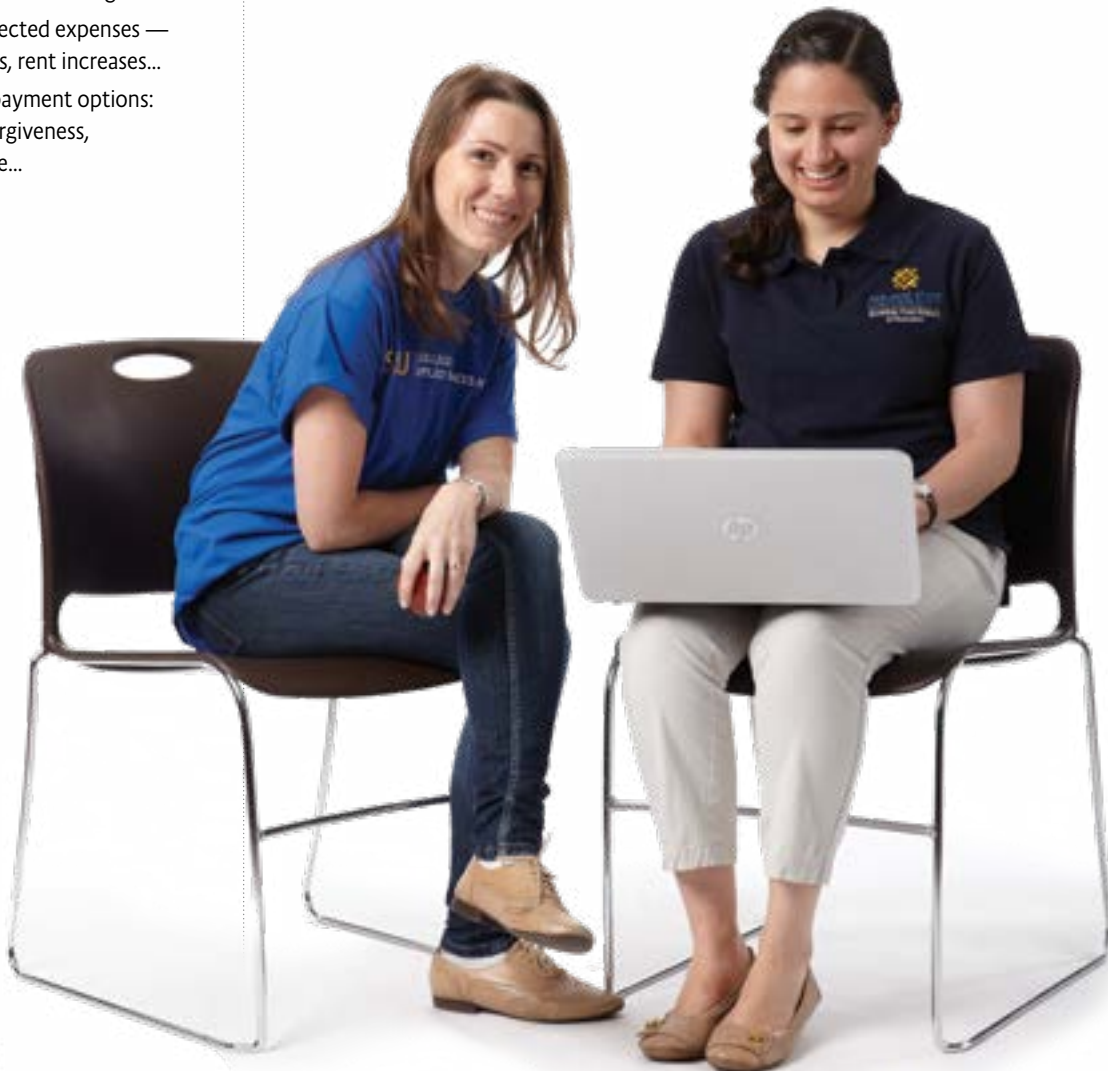
Luz Nutritional Science