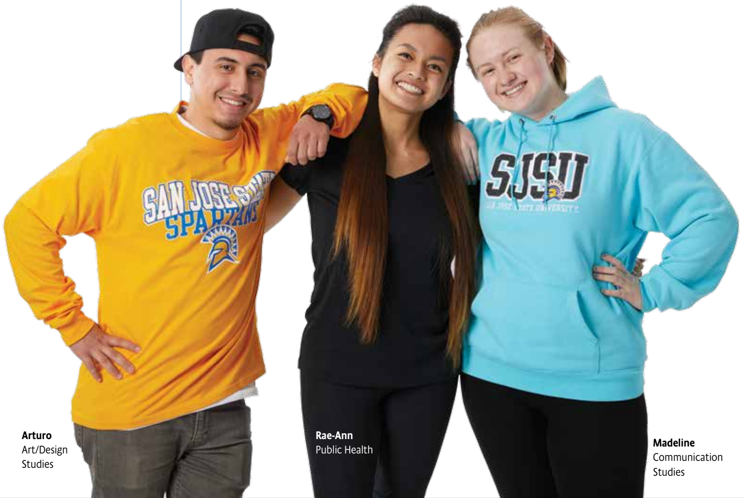
Arturo Art/Design Studies

Pay your enrollment deposit at https://nextsteps.sjsu.edu