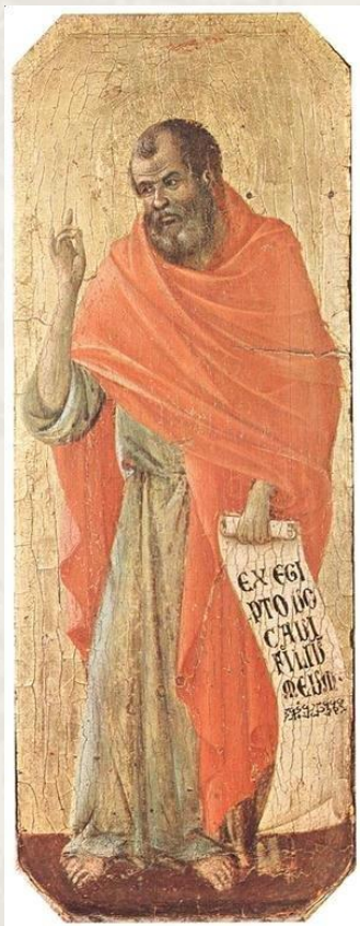
This Photo by Unknown author is licensed under CC BY-NC-ND .