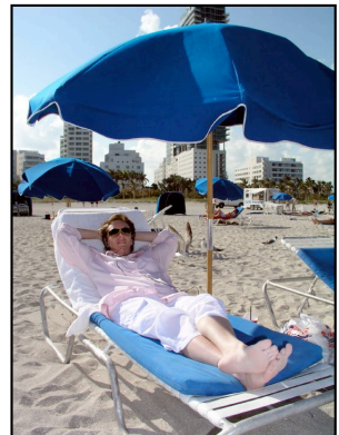
(T) Arches National Park (B) South Beach, FL