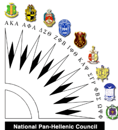
National Pan-Hellenic Council (NPHC)