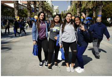
Homecoming Block Party