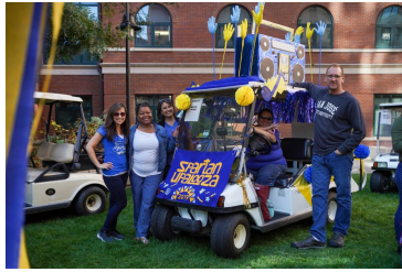
Homecoming Golf Cart Parade