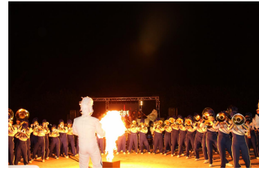
Fire on the Fountain

Student Involvement | 408.924.5950 | 1400 Student Union | @SJSUgetinvolved@sjsu.edu