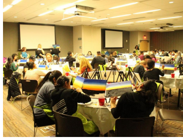
Paint Night: International and Transfer Student Mixer