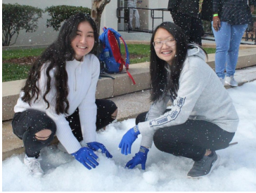
Snow Day Kick-Off