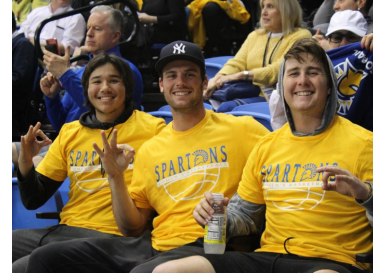
SJSU Women's Basketball vs Boise State

Student Involvement | 408.924.5950 | 1400 Student Union | @SJSUgetinvolved@sjsu.edu