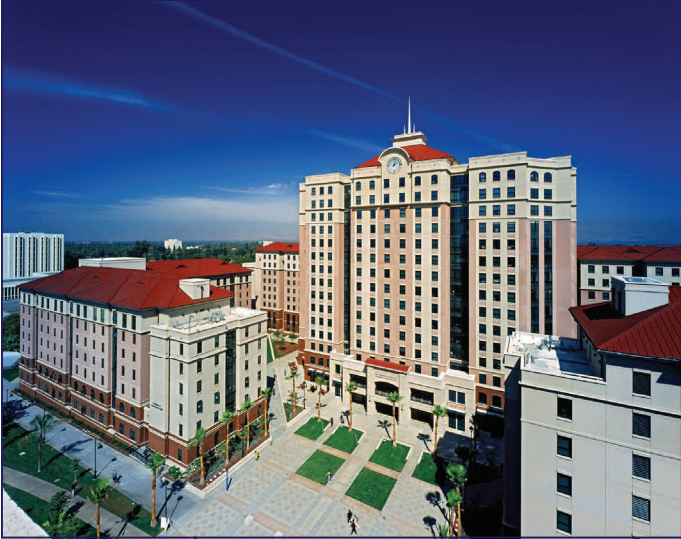
Campus Village B offers modern accommodations for Interns