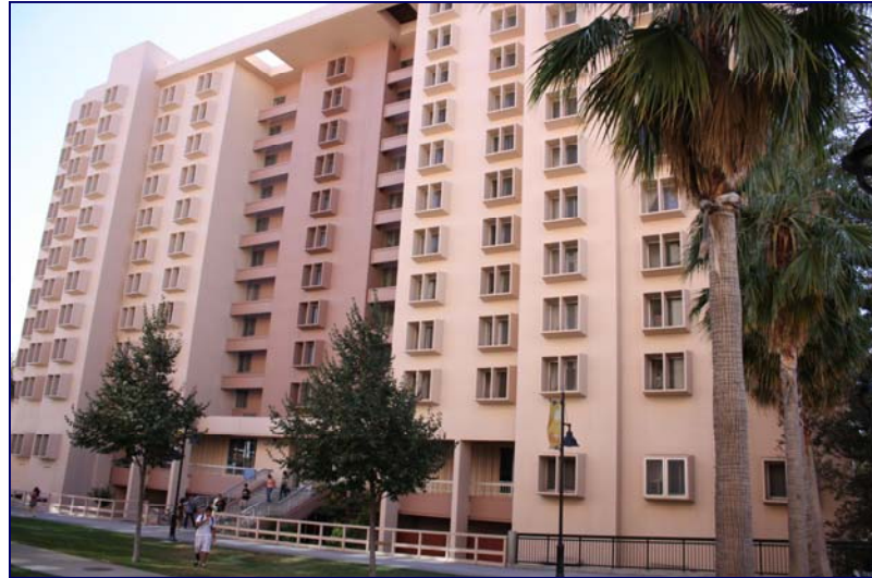
The Joe West Hall offers affordable, community living.

Joe West Hall houses over 650 residents, offering single and double occupancy rooms. Joe West Hall provides a supportive, community based environment. Joe West Hall is the perfect environment for the individual who wants to experience traditional college living, with a little added privacy.