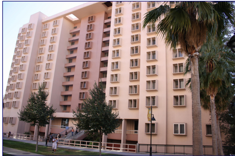
Joe West Hall offers affordable, community living.

Joe West Hall houses over 650 residents, offering single and double occupancy rooms. Joe West Hall provides a supportive, community based environment. Joe West Hall is the perfect environment for the individual who wants to experience traditional college living, with a little added privacy.