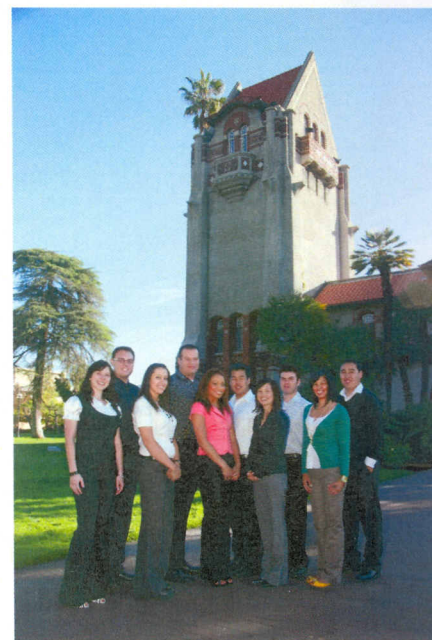
HRTM students on Tower Lawn

The faculty, who I have encountered in HRTM, in my opinion, is the best, not only in their mastery of the content they teach, but also in their caring ability to challenge, encourage and assist students to be successful. It has been a wonderful experience for me here in HRTM and I will always be grateful for this amazing journey.