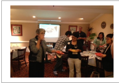
Business Etiquette Dinner

The next opportunity for MST students to attend the MST Retreat will be spring 2014.