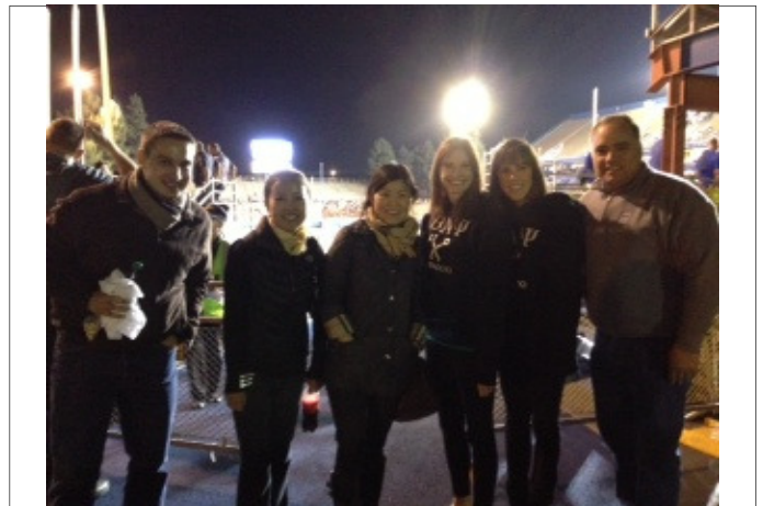
Retreat participants attended the San Jose State Spartans Football game vs. Utah State