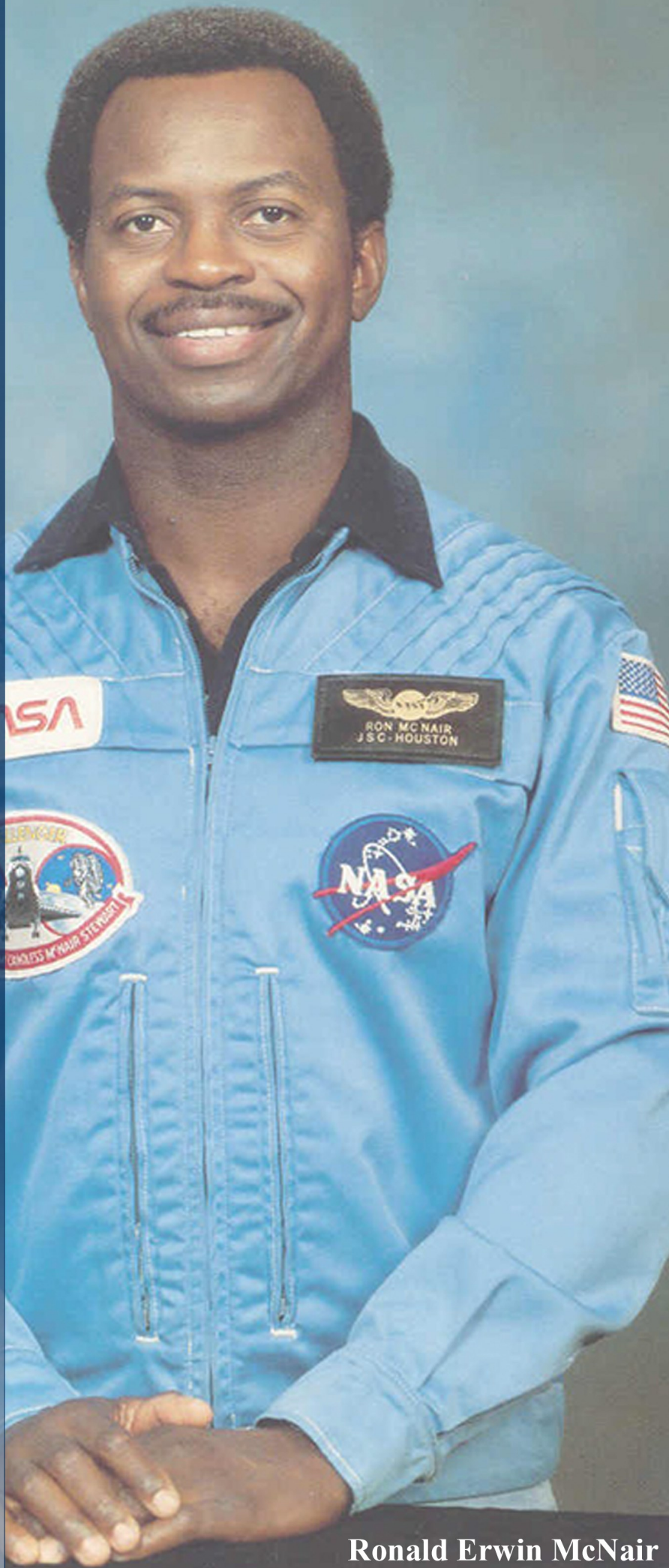
Ronald Erwin McNair