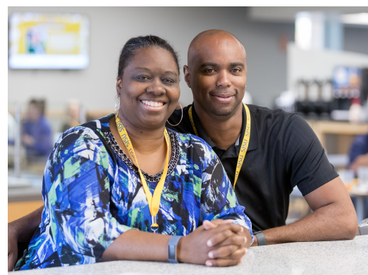
Parents at The Commons

Spartan Eats services all eateries, including the popular locations like Starbucks, Panda Express, and Taco Bell. They also are pleased to provide all of your residential dining needs at the Dining Commons, and offer a variety of meal plans for all students.