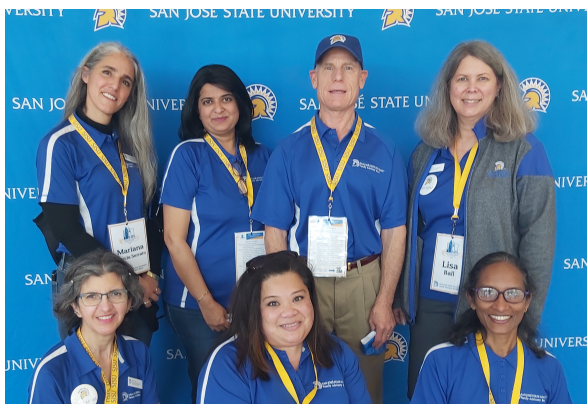
Family Advisory Board Members volunteering at Parent and Family Weekend

If you have any questions or are interested in learning more about the board, please email us at family-advisory-board@sjsu.edu .