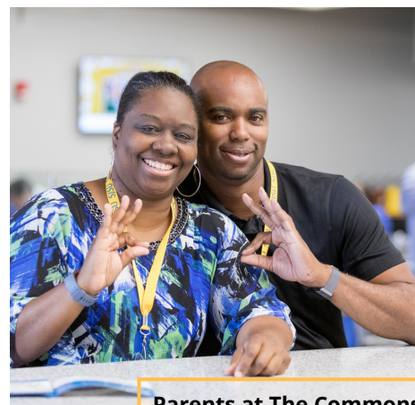
Parents at The Commons

Spartan Eats services all eateries, including the popular locations like Starbucks, Panda Express, and Taco Bell. They also are pleased to provide all of your residential dining needs at the Dining Commons, and offer a variety of meal plans for all students.