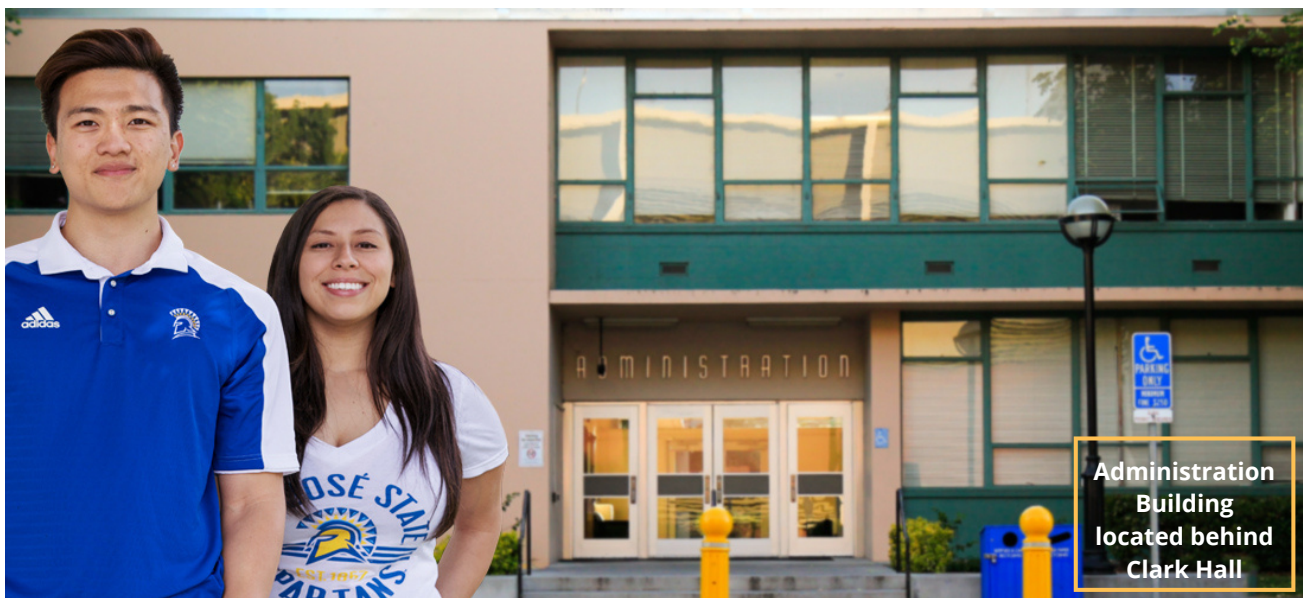
Administration Building located behind Clark Hall

Contact SCED at (408)924-5985 or studentconduct@sjsu.edu