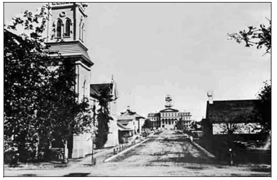
View of the California Normal School Looking Down San Antonio Street from Second Street

October 20, 1870 : The cornerstone of the school at the Washington Square site, donated by the City of San José, was laid on October 20, 1870. This event was celebrated by students and community members and government officials. Over 3,000 people attended the festivities that began with a parade from City Hall up First Street to San Antonio Street and then east to Washington Square. A time capsule, containing such items as a copy of the California school laws, a normal school diploma, a local paper, a copy of the San José city charter and an account (in Spanish) of the first public school in the city (built in 1811), was placed beneath the cornerstone.