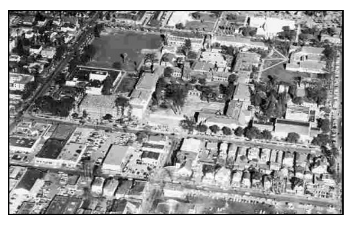
This 1955 aerial photo shows the Carnegie Library building(then the Student Union) in the lower lefthand (NW) corner of the campus. The Library Building(Wahlquist South) and the Library Annex (Wahlquist Central) lie to the right. The Clark Library was later built on a portion of the empty land shown at the top of the photo.

with a few hundred volumes, was housed in the Normal School Building from 1870-1910. In 1902, the Carnegie Public Library opened at the corner of San Fernando Streets, the land having been donated back to the city by the Normal School. The site of the Carnegie Library was purchased back by the State College in 1936 and became the Student The San José Public Library moved to Market Street and in 1990 the main public library was dedicated at its current location.