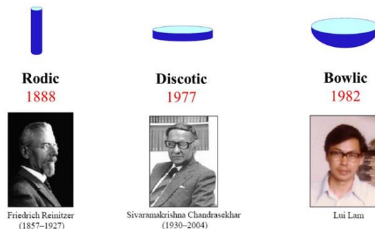
Fig. 1. Three types of liquid crystals in the world. Bowlic, the 3 rd type, was invented by Lam.