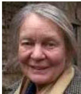
Iris Murdoch 1919-1999 Philosopher, Novelist http://www.robotwisdom.com/jorn/iris.html