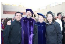
The students.