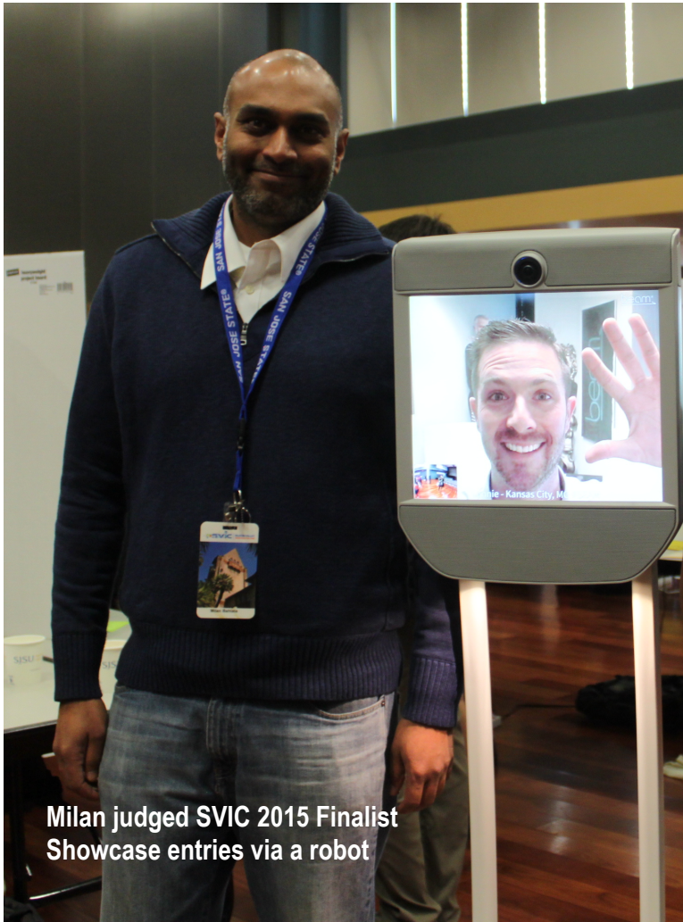
Milan judged SVIC 2015 Finalist Showcase entries via a robot