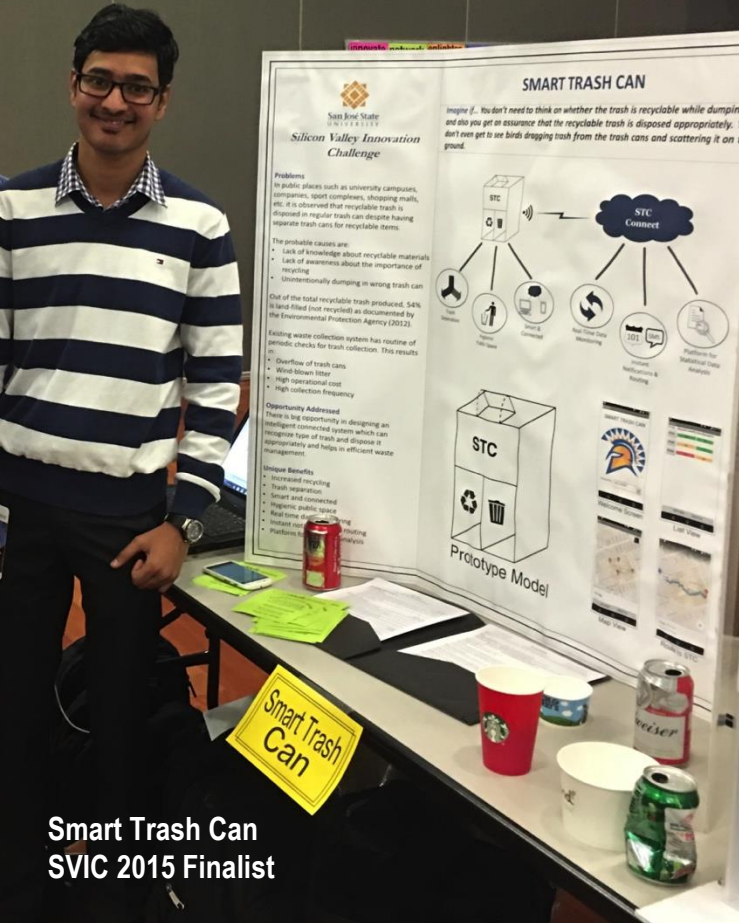
Smart Trash Can SVIC 2015 Finalist