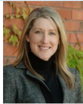
Follow the Advocate on Twitter @FTBAdvocate