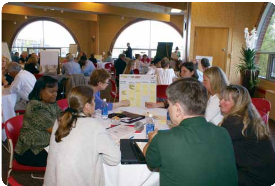
Faculty at Benedictine University